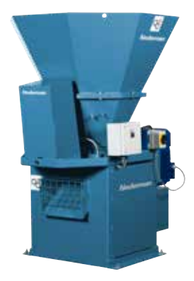
The integrated system crushes the chips, de-oils the chips and recovers coolant.