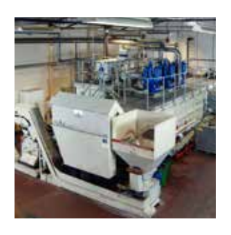
Our coolant cleaning solutions cover most operational requirements. This includes the Presto System that delivers coolant to two or more machine tools of the same type.