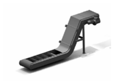
We have a conveyor for every need: Belt Conveyors, Magnetic Conveyors, Drag Conveyors, and Vacuum Conveying Systems.