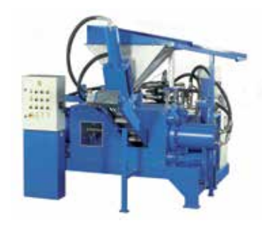
Presses chips from machining into cylindrical briquettes and recovers coolant.