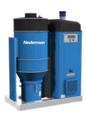
The high vacuum suction system can be used for automatic and manual chip handling and machine cleaning. Chips are removed directly from the machines avoiding unnecessary stops. Premises and machines can also be manually cleaned, improving productivity and preventing accidents.